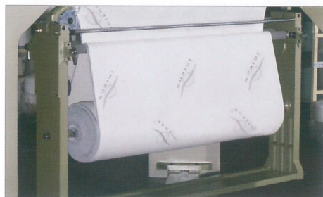
▲ High Capacity Take-Down System

The New Challenge Of Mattress Ticking Machine