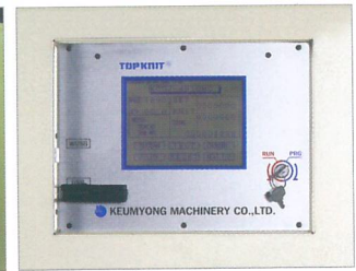
WAC Pattern Controller